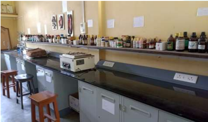
• Zoology Lab