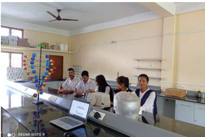
• Botany lab