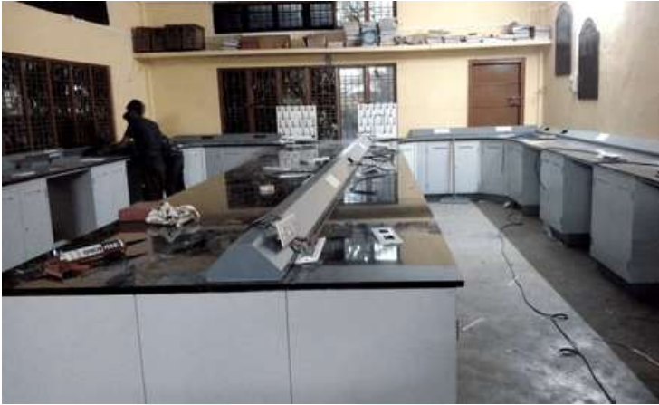
• Physics Lab