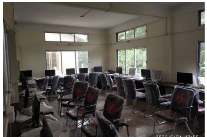
• Computer Lab