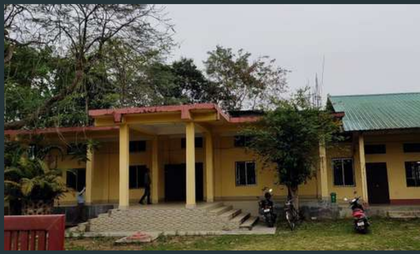
Mariani College Old Campus (Science and Commerce)