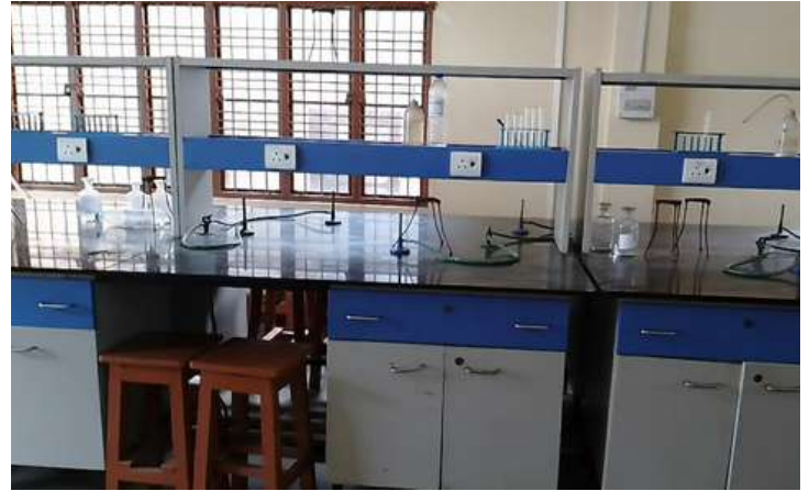
• Chemistry Lab