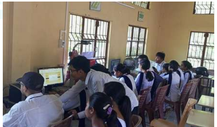
• GIS Lab, Geography Deptt.