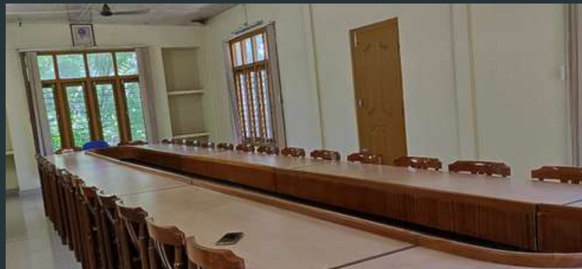
Sofia Memorial Hall