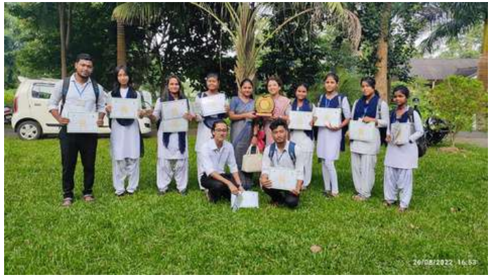
Team of Students receiving 2nd Prize in District Level Quiz Competition organised by Toklai Tea Research Institute