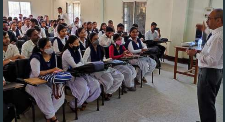
Digital Classroom, Commerce