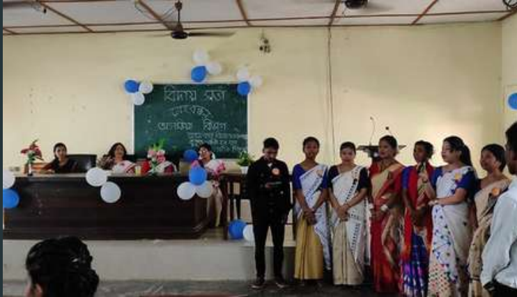
Conference Hall, Main Campus