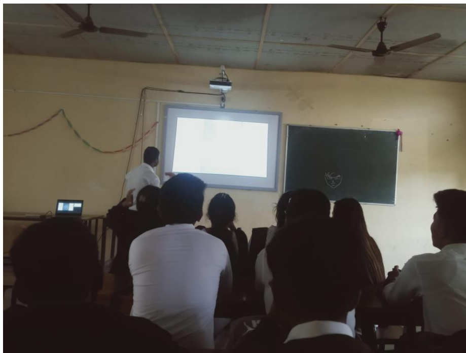
Celebration of Science Day at Bhelauguri High School,(quiz competition was held),28 th February