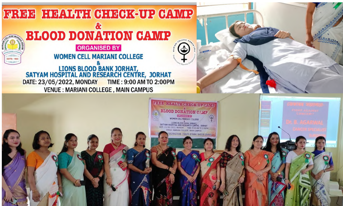
A Free Health Check-up Camp and Blood Donation Camp was organised by Women Cell, Mariani College, in Association with Lions Blood Bank, Jorhat & Satyam Hospital and Research Centre, Jorhat, on 23rd May, 2022.