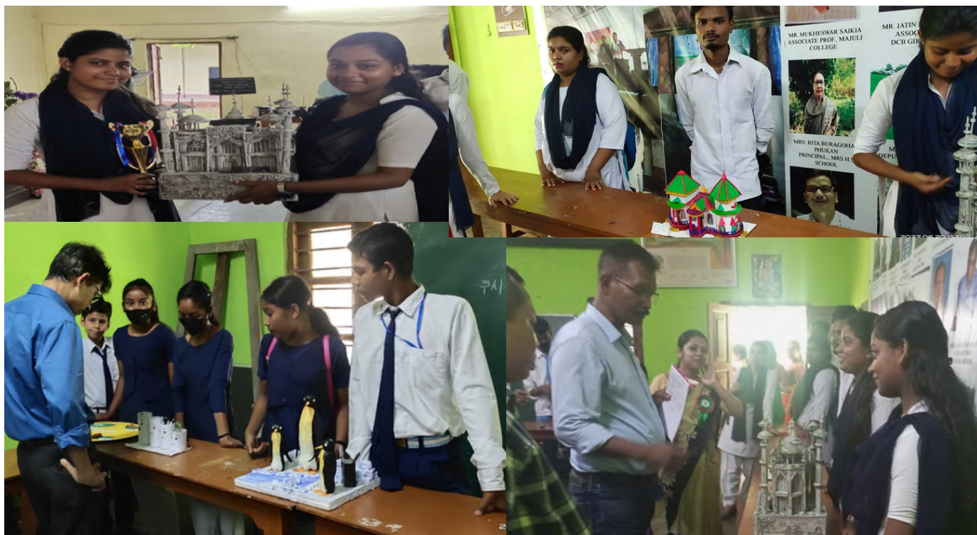
On 20th June, 2022, Rabha Diwas was observed by the members of Women Cell along with The Principal and the students of the college. The Women Cell, Mariani College, organized a “BEST OUT OF WASTE” Competition for the students on 20th June, 2022 for School Students of Mariani locality and the Students of the College. The College Students as well as the School Students showed excellent creativity in utilizing waste products into useful products.