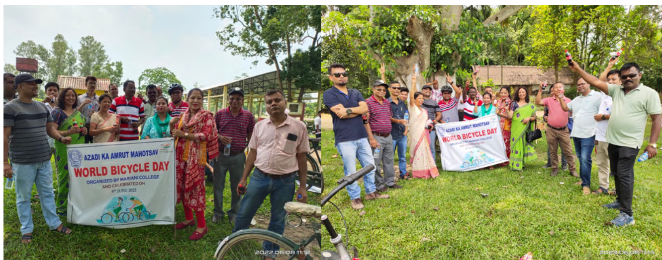
World Cycle Day was celebrated by Women Cell, Mariani College on 8th June 2022. Cold drinks and food items were also distributed as part of the program.