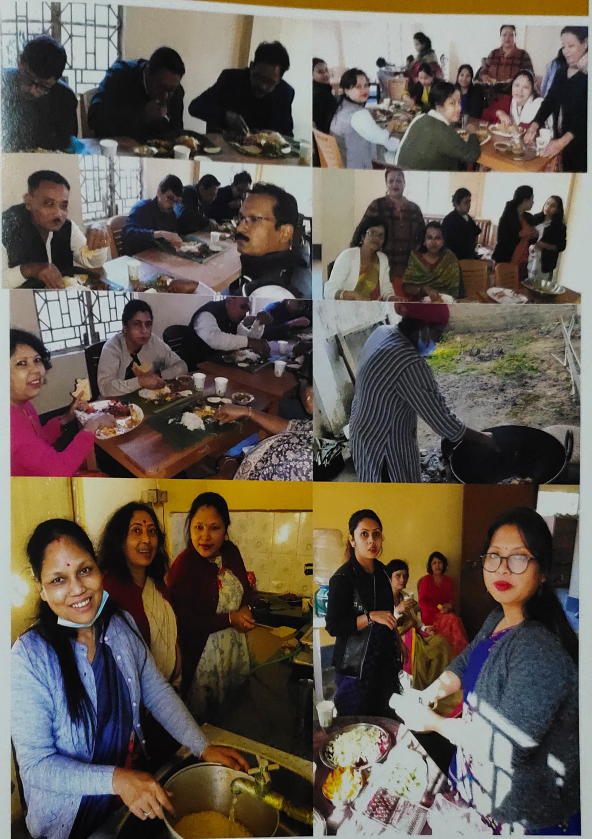
Kitchen Department and Lunch Session