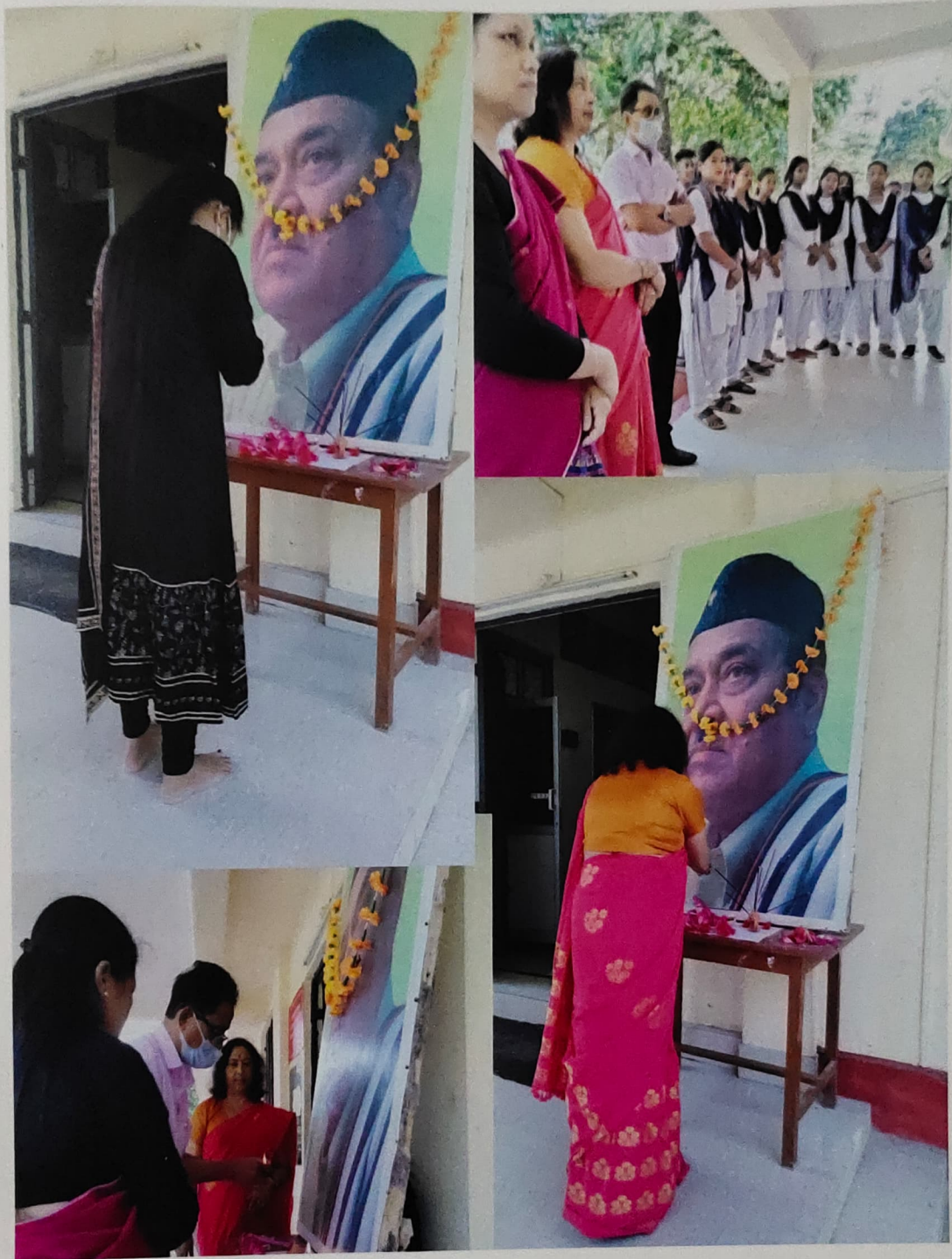
On the 5th of November 2021, Dr. Bhupen Hazarika's Death Anniversary was observed by the members of Women Cell along with The Principal and the students of the college.