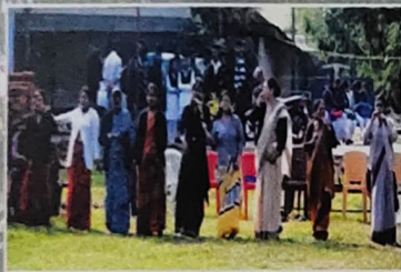
10. ANNUAL SPORTS EVENT OF THE TEACHERS ON 12/01/2016.