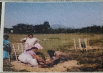
7. TREE PLANTATION IN THE COLLEGE CAMPUS ON 08/03/2014.