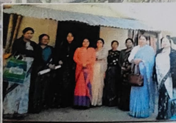
11. FIELD SURVEY IN BIJOYPUR VILLAGE, NAGAD HOOLIE.