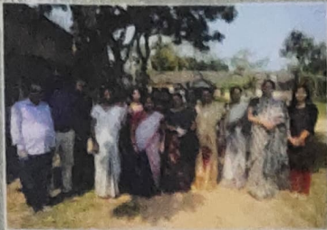
8. VISIT TO THE "OBSERVATION HOME", JORHAT CENTRAL JAIL, JORHAT.