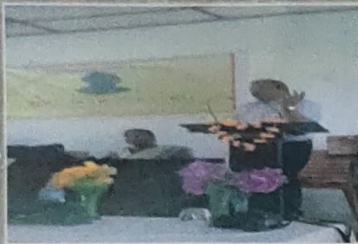
9. CELEBRATION OF BISHNU RABHA DIVAS IN THE COLLEGE ON 20/06/2015.