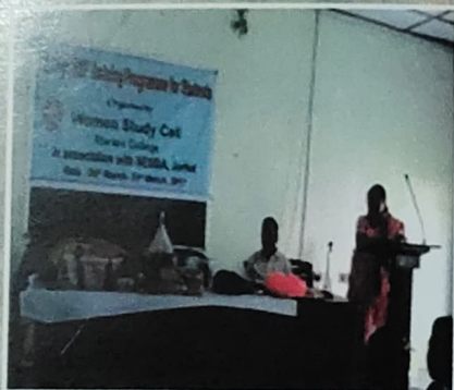
INAUGURATION OF EDP PROGRAMME

THE WOMEN'S STUDY CELL, MARIANI COLLEGE, ORGANISED A 7 DAYS EDP TRAINING PROGRAMME FROM 24TH MARCH, 2017 TO 31ST MARCH, 2017, IN ASSOCIATION WITH NSSA. THE PROGRAMME INCLUDED AGARBATTI MAKING, CUSHION MAKING, CANDLE MAKING, MUSHROOM CULTIVATION AND MAKING VARIOUS ITEMS FROM WASTE MATERIALS. THE PROGRAMME WAS VERY SUCCESSFUL WITH A TOTAL OF 28 PARTICIPANTS. THE PARTICIPANTS WERE GIVEN CERTIFICATES AFTER THE SUCCESSFUL COMPLETION OF THE PROGRAMME.