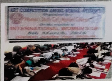
12. DRAWING COMPETITION IN THE COLLEGE AMONG SCHOOL STUDENTS ON 08/03/2016.